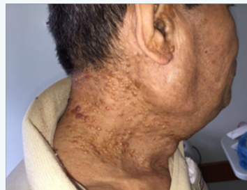
Figure 4: Disseminated skin vesicles and parotid enlargement.