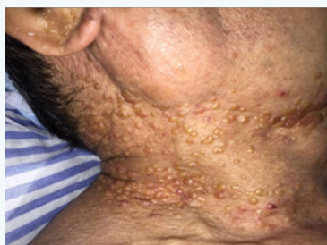
Figure 2: Disseminated vesicles in skin, ear and parotid enlargement.