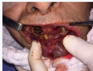
Figure 3: Lip and tongue edema.