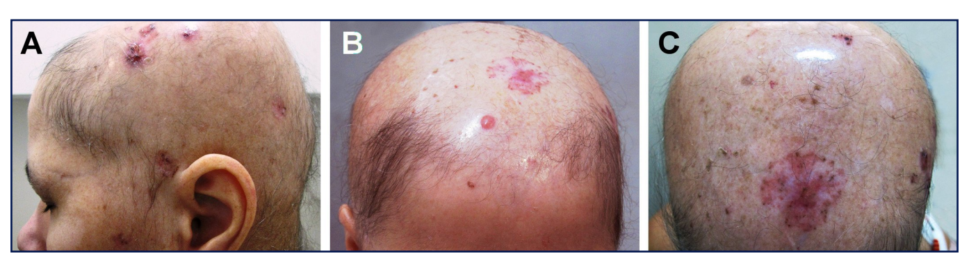
Figure 1 Multiple basal cell carcinomas on facial (A) and scalp (B, C) skin.