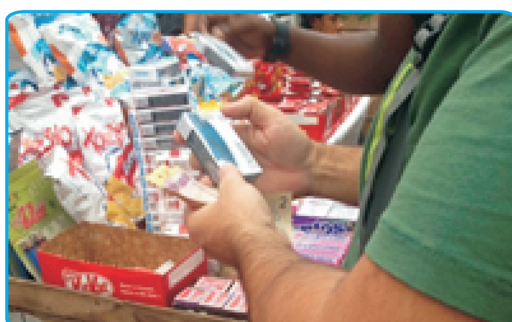
Fig 2. Counterfeiting of the best-selling cigarette brand