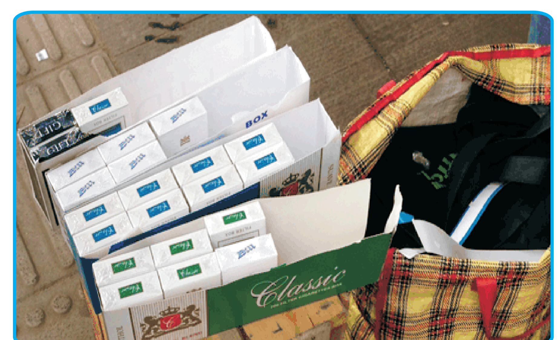
Fig 3. Counterfeiting on street vendor