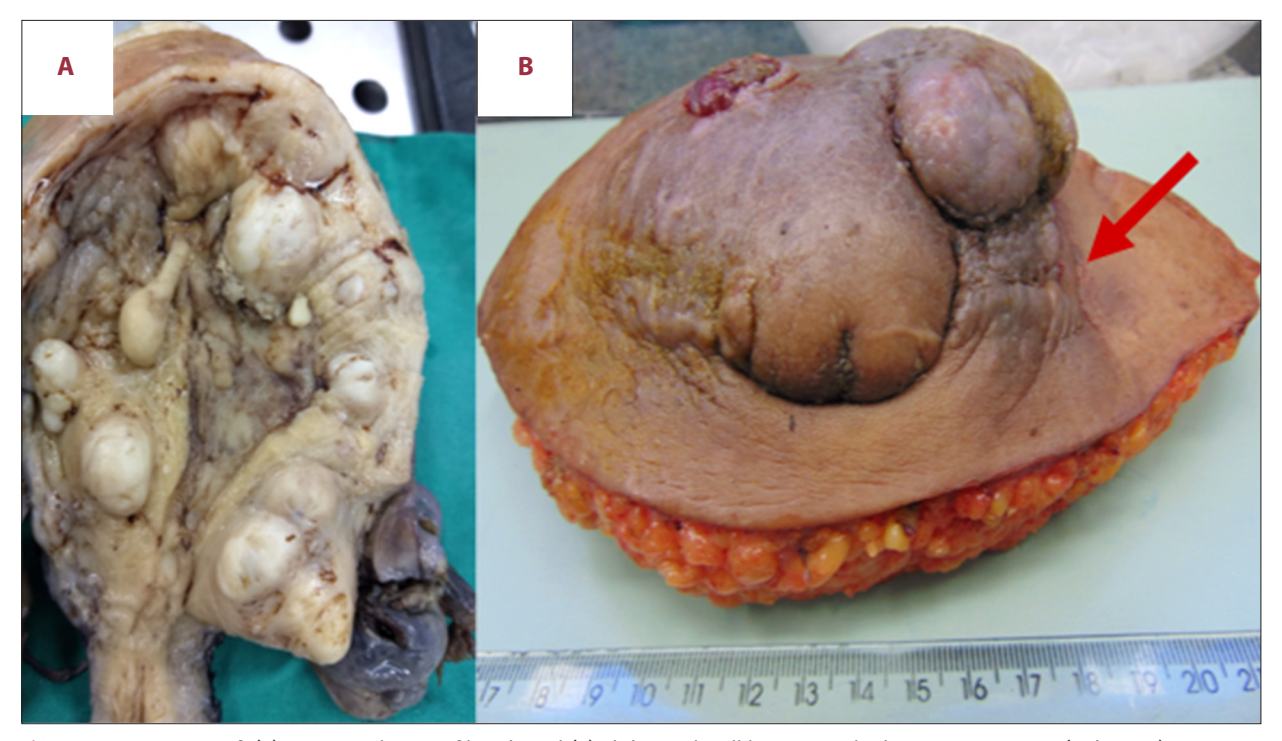
Figure 3. Macroscopy of: (A) uterus with many fibroids and (B) abdominal wall lesion attached to a previous scar (red arrow).